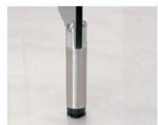
45 mm leg