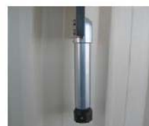
35 mm leg